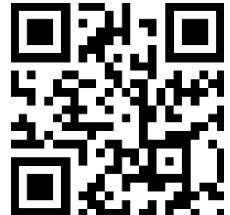
Info and registration: https://tiny.cc/ps1unz

Each session runs from 9:15 – 12:30 and will be followed by (optional) lunch. Participants should commit to doing the preparatory readings for all sessions. Series registration is required.